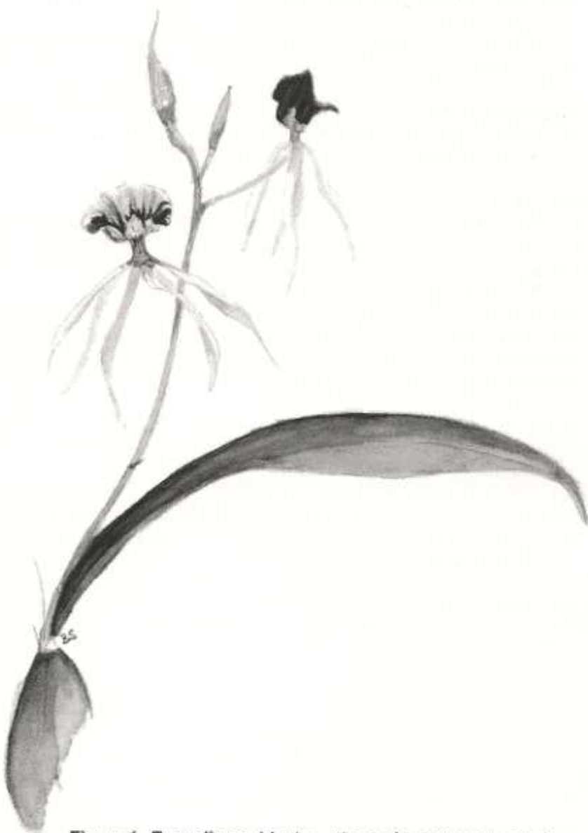
Figure 1. Encyclia cochleata — the national flower of Belize.

The collection in the past had been amassed from plants purchased at auction and from the many orchid nurseries in the UK.