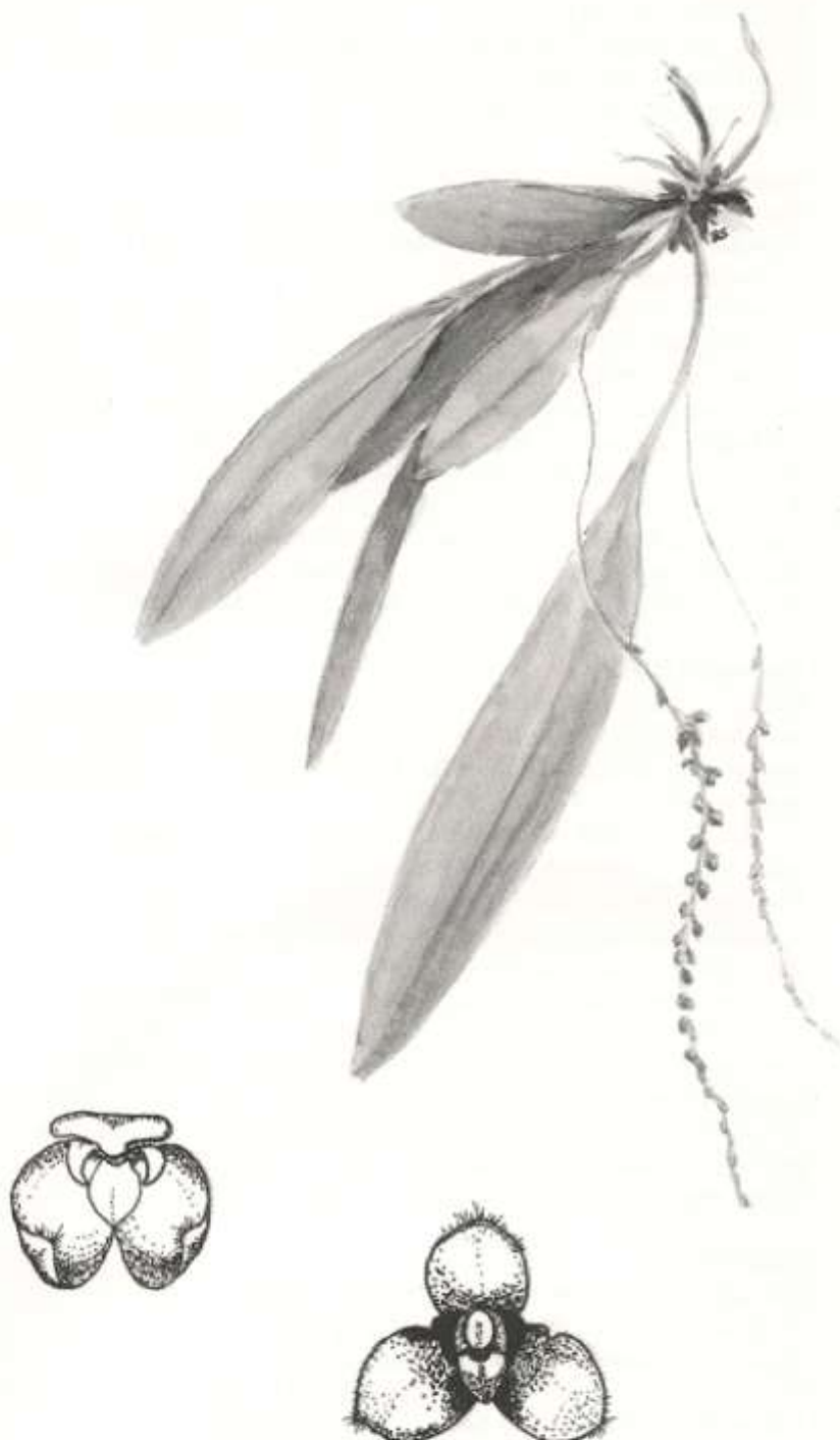
Figure 2. Stelis ciliaris with details of flowers.

Epidendrum secundum was also collected at Pretty See Ranch in the Belize District and is considered an uncommon orchid. A medium-sized plant with stems holding many green to purple coloured leaves. The flowers are arranged in a terminal cluster and