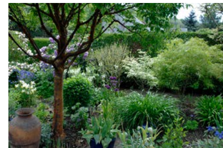
AGM Visit to Kilmacomma Garden

The sloping garden has two levels to the rear of the house achieved by building a low brick wall. The lower section is on the flat, while the upper part is on a gentle slope bounded by a beautiful, original old stone wall. Here are two seating areas where you can relax and admire the garden and the tree-clad hill in the distance. Kilmacomma garden had the warmth