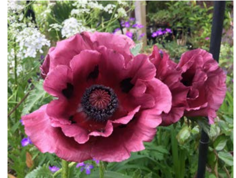
Papaver orientale 'Patty's Plum'

Lesley and Moira greeted us and explained how for the last 32 years, they have worked, restored and extended their collection of gardens totalling an area of one acre. A map was handed out to help guide us along the winding paths through the various garden rooms, from the exuberant cottage garden with masses of hardy geraniums planted