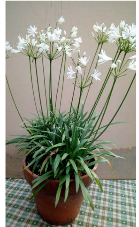
Agapanthus 'Kilmurry White'.

Agapanthus are among the easiest grown and most reliable of herbaceous plants. Full sun will give better flowering, with a gentle feed each spring, maybe a mulch to keep weeds down and reduce water needs. This would be ideal for a pot as not tall, but protect in severe winter frosts. Available from Kilmurry Nursery.