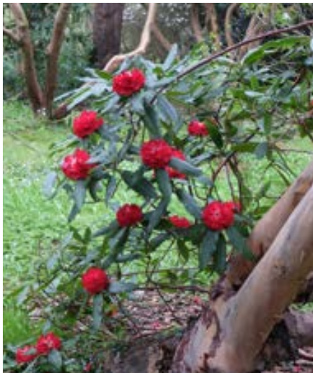
Rhododendron barbatum at Mount Usher Gardens