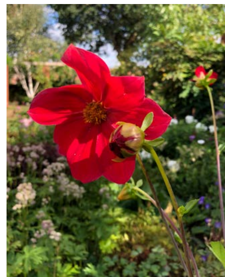
Dahlia 'Matt Armour'