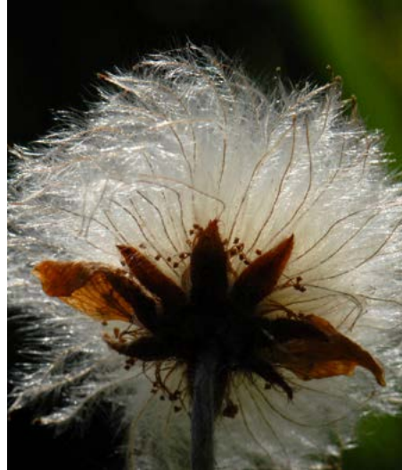
Dryas drummondii seedhead illustrating back lighting

ornamental grasses to catch the light and provide good entry points for the photos. Bernard explained how difficult magnolias are to photograph for example whereas crocosmia is a good flower to take shots of. We then saw many images taken at Kilmacurragh and the JFK Arboretum. Symmetry and geometry are things he looks for when setting up an image and Tourin provided several examples of this. Uneven numbers of flowers or subjects work better was another tip Bernard mentioned. He finished with a selection of different photos of flowers and pointed out details to look out for. We had a wonderful evening and plenty of tips for those of us who are keen photographers in the garden.