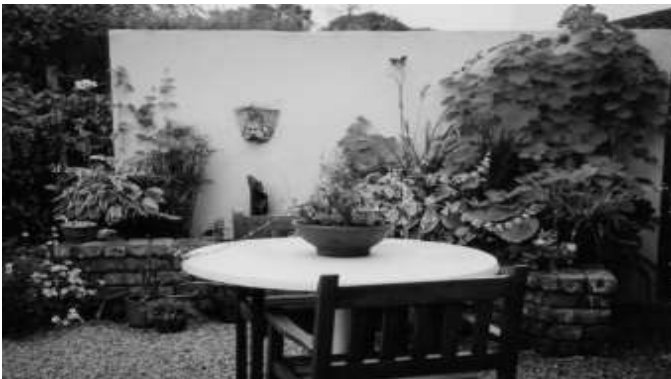
Anna's redesigned patio area.

The rear garden, measuring approximately 20m x17m faces north and is on a steep slope. Planting takes account of this and waterlogging does not occur, because of the nature of the site. Directly outside the back door, I was struck by a twining Codonopsis convolvulacea 'Forrest's Form' climbing on Berberis thunbergii 'Helmond Pillar'. Anna grew the berberis from seed and its narrow upright habit is an ideal support for the pale blue Codonopsis . Nearby, on the north-facing wall, the first blooms of Lapageria rosea were beginning to unfold.