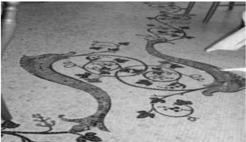
The mosaic floor in the Terrace Restaurant.

A collection of cacti and succulents, growing happily in full sun add an exotic touch and guide you to the Rosery , at the end of the ship or should I say garden! A wonderful stopping point, as the scent of roses lingers in the air. Onward to the Provencal Garden , which is more exposed to the elements and has wonderfully shaped olive trees, sculpted by the wind. The large pines, also in this area, protect the Temple of Love and form a perfect backdrop to the view from the house. This is certainly the most popular spot for photographers in the garden as the Villa can be seen in its full glory.