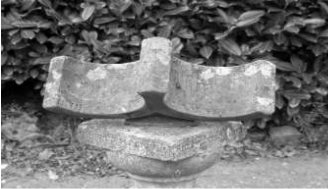
The unusual sundial in Knockmore.